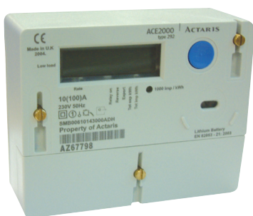
▶ ACE2000 type 292

The Actaris ACE2000 type 292 meter with integral Real Time Clock is a compact, cost-effective meter offering complex tariff functionality. The meter is well equipped for the modern utility environment with a number of enhanced features including communications capability that meets with international standards.